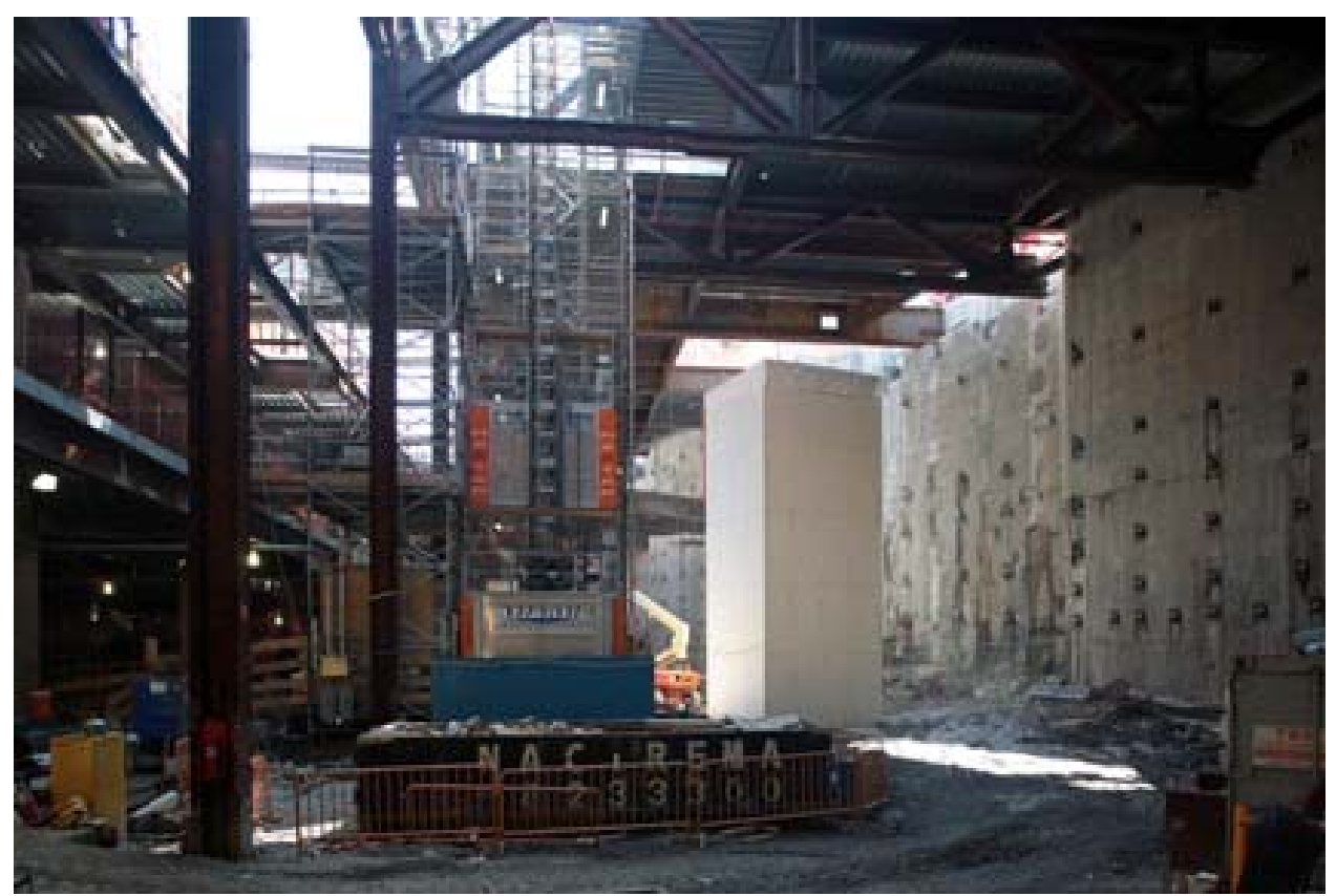
September 2009. Last Column (in climate controlled enclosure) and the exposed slurry wall.