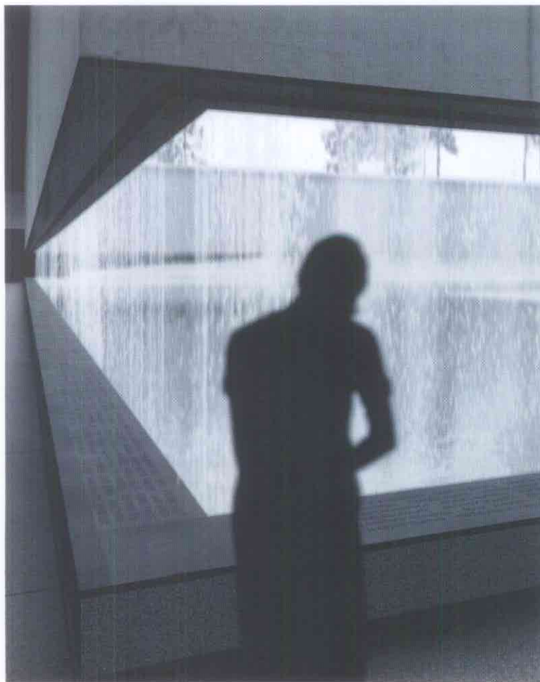
Curtain of water with victims names surrounding pool