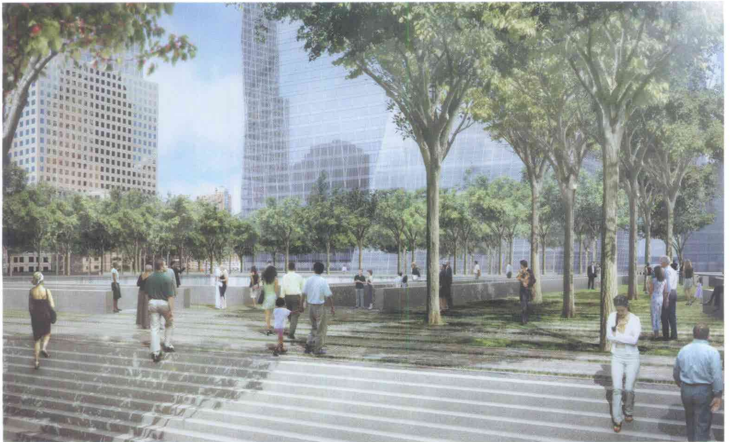
View of Plaza Level From Liberty Street