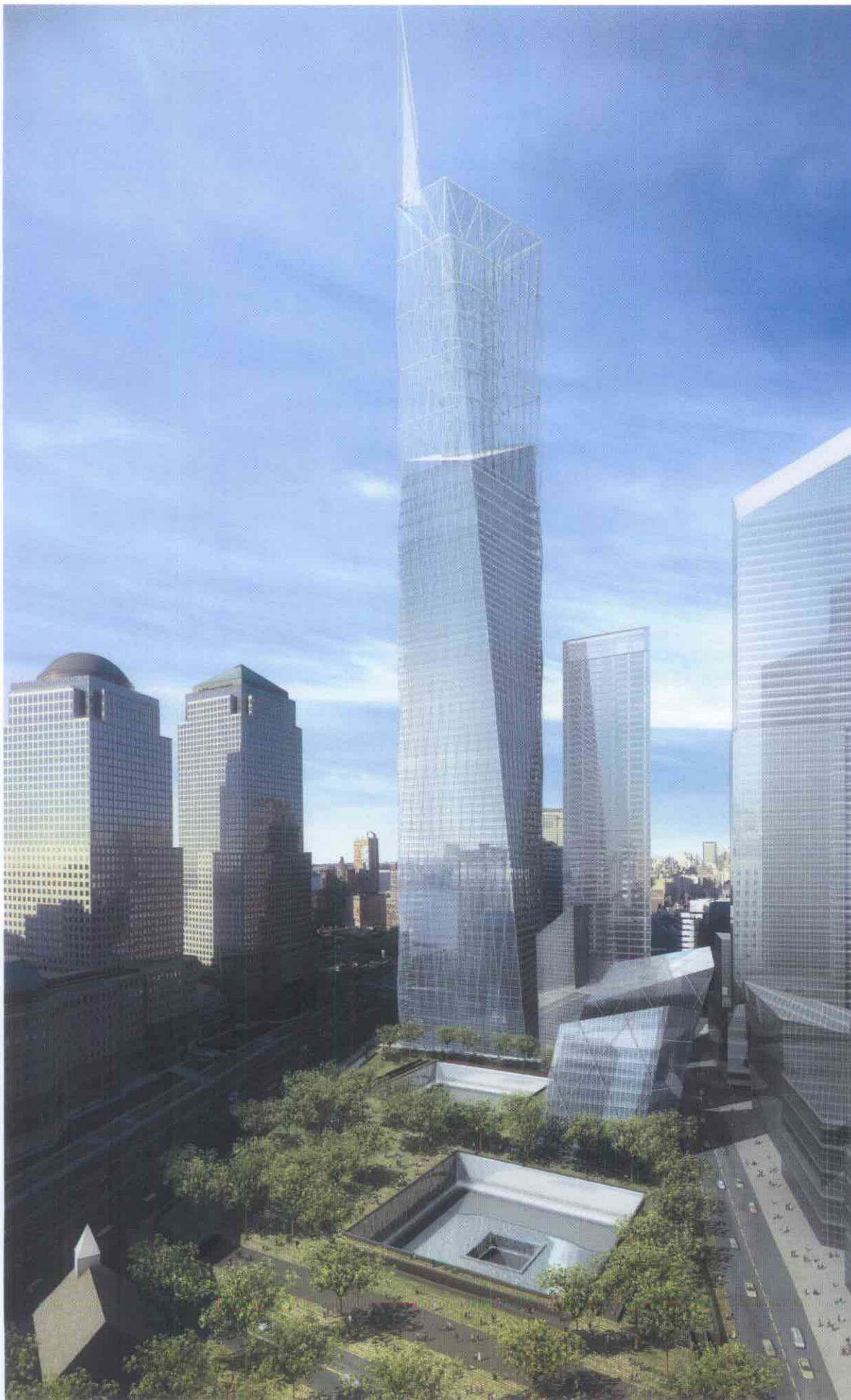
Aerial view of "Reflecting Absence" looking North