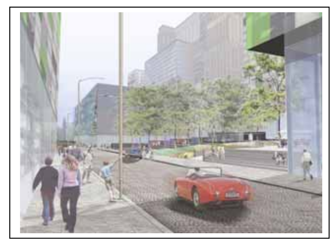
Fig. 4: Conceptual rendering of the site.