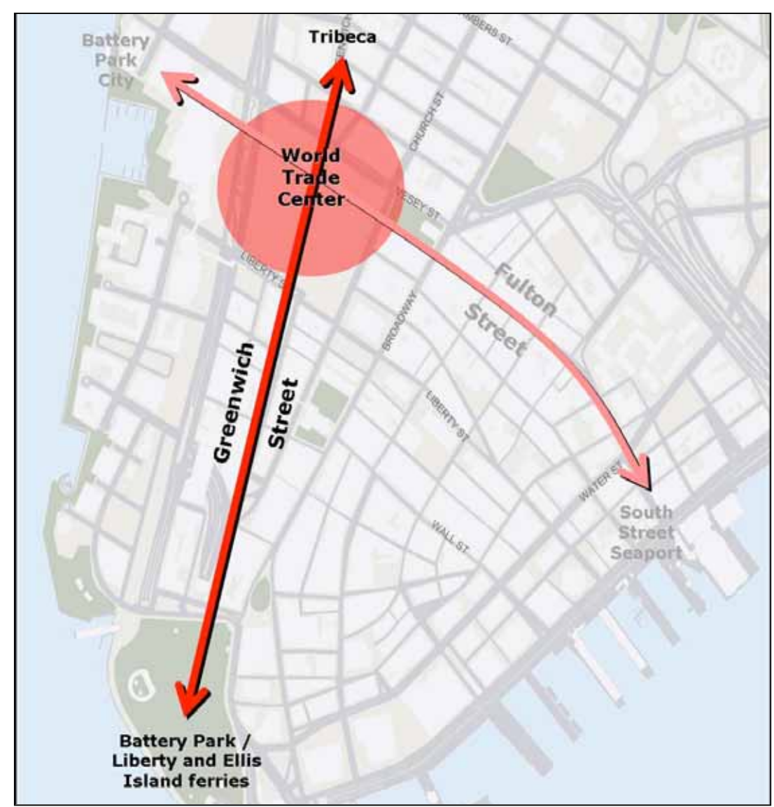
Fig. 2: Diagram of the two streets to be rebuilt through the World Trade Center site.

The 8-acre Brooklyn Battery Tunnel Plaza represents the single-largest development opportunity downtown after the Trade Center site. The overarching goal of the Greenwich Street South Redevelopment Plan is to unlock the full potential of the Brooklyn Battery Tunnel Plaza to support new residential and cultural uses and forge new connections between neighborhoods. The careful use of this valuable resource is critical to successful redevelopment. The study envisions the transformation of this under-performing, 50-acre area into a new