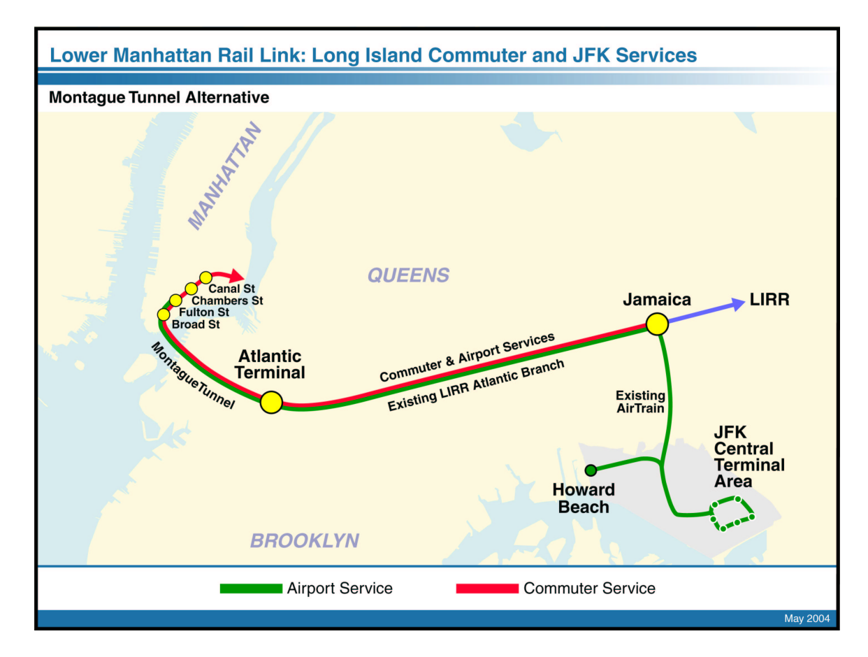
Figure 3: Montague Street Tunnel Alternative